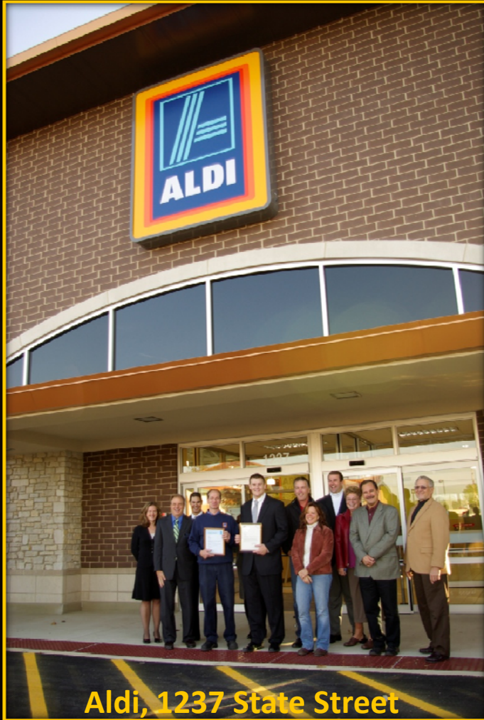
Aldi, 1237 State Street