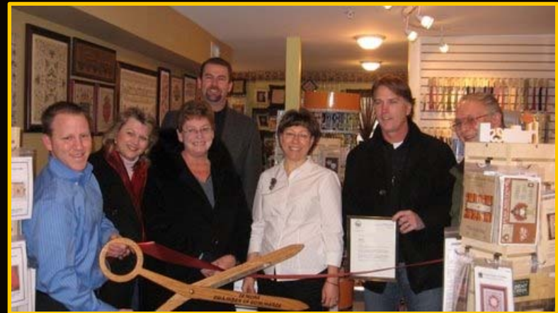
Inspired Needle, Ltd., 315 Illinois Street