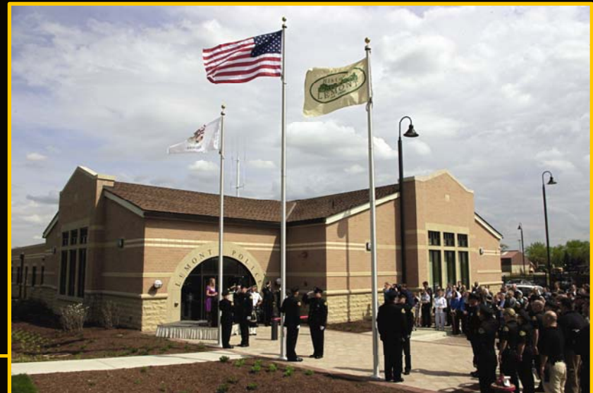
Police Dept. Dedication Ceremony – May 8, 2009