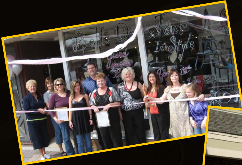
Belle De Jour – In Style 114 Stephen Street