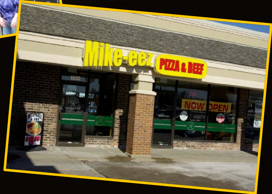
Mike-Eez Pizza 1066 S. State Street