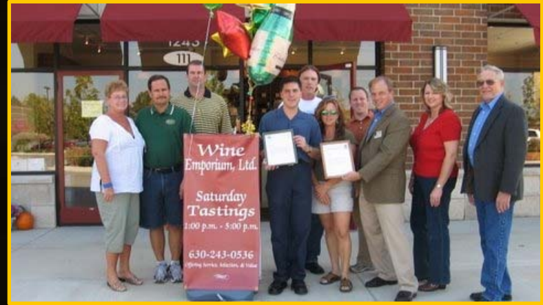
Wine Emporium, 1243 State Street