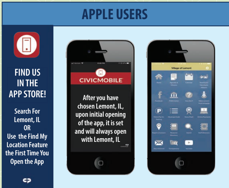
Example: Mobile App For Apple Users