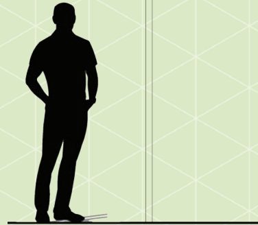
CONCEPT WAYFINDING SIGN