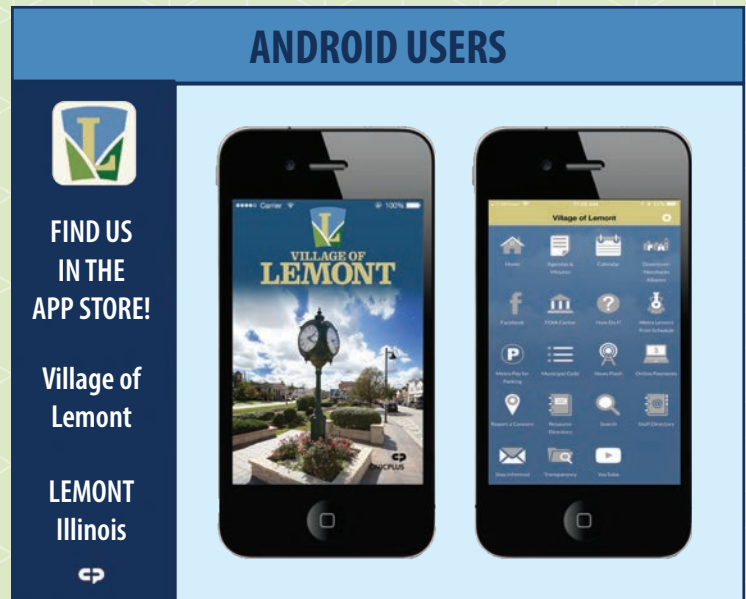
Example: Mobile App For Android Users