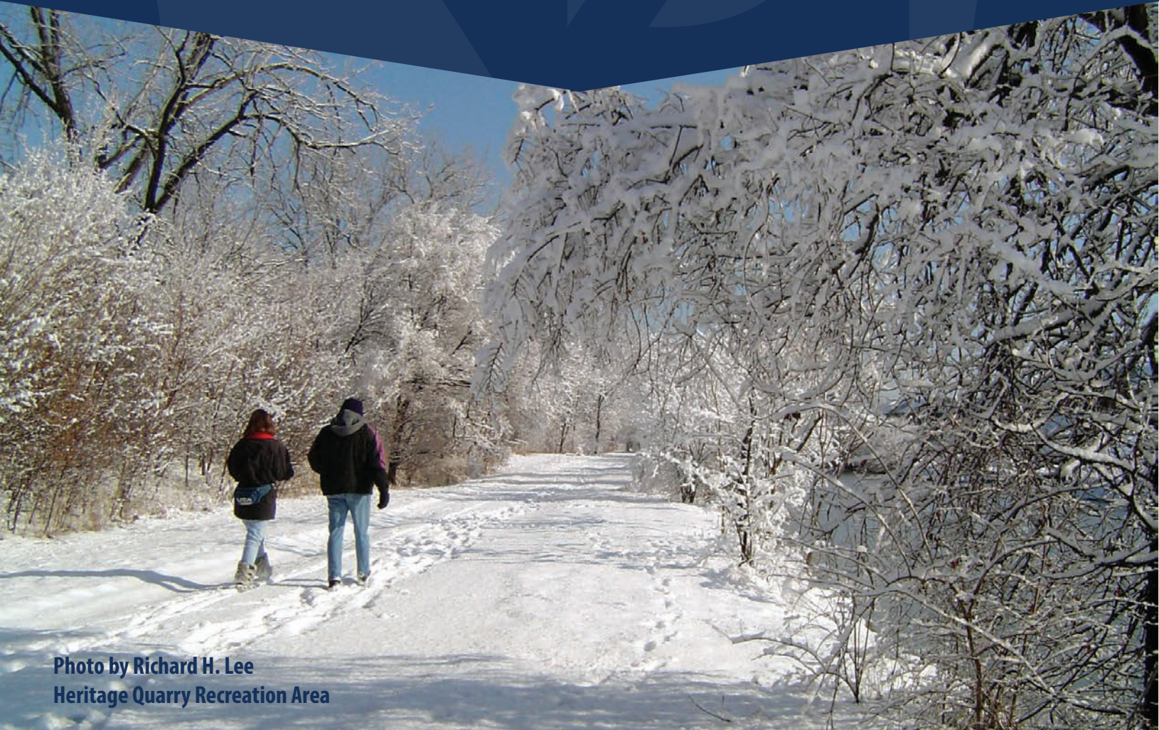
Heritage Quarry Recreation Area