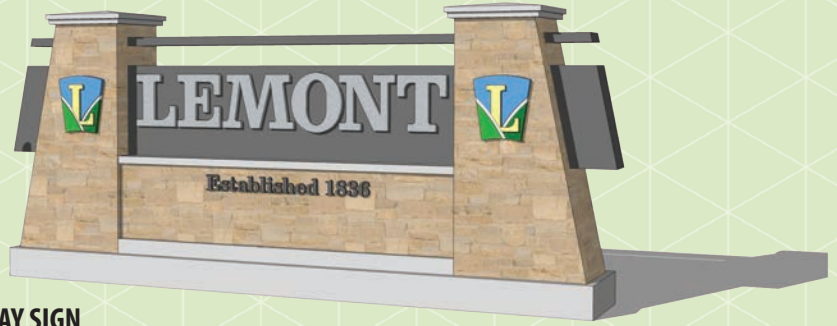
CONCEPT GATEWAY SIGN

The Village anticipates that the development phase of the Signage Master Plan will be completed in 2017, and priority signs will be constructed in the spring of 2018. Additional signs will be constructed over time as budget allows.