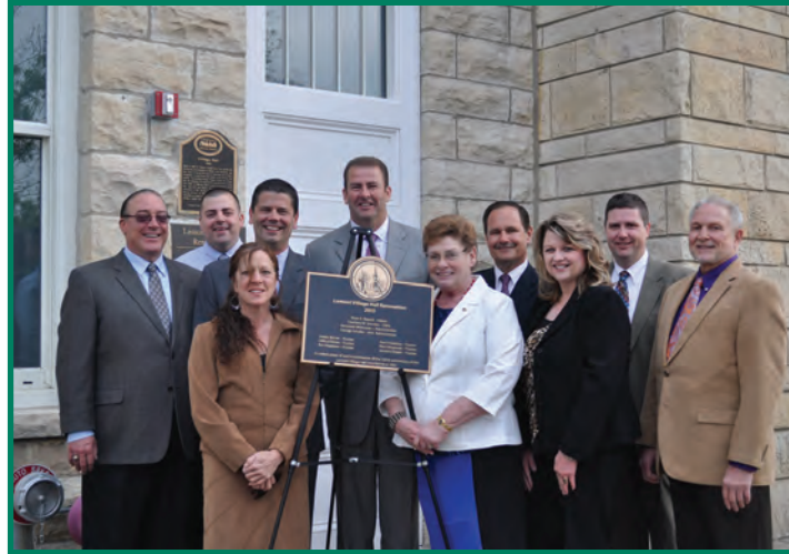
VILLAGE HALL REDEDICATION May 13, 2013