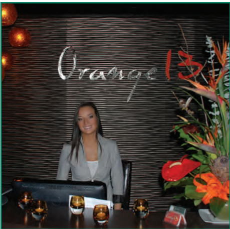
Orange 13 Lounge, Inc. 14196 McCarthy Road