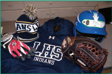
Eich's Sports, Inc. 216 Main Street