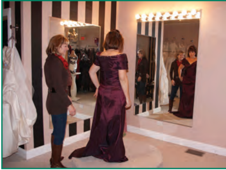
Martellen Dress & Bridal Boutique 218-220 Main Street