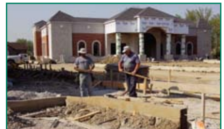
Crystal Grand Banquets