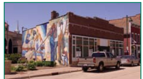
Canal Street Deli