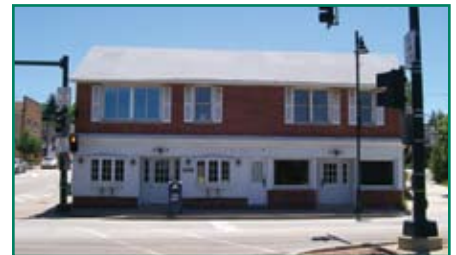
Main Street Lounge & Pizzeria