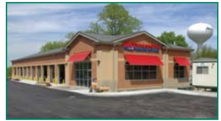
Firestone Complete Auto Care