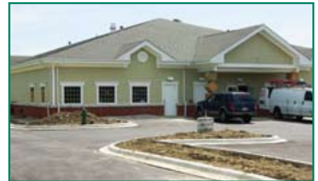
The Learning Center