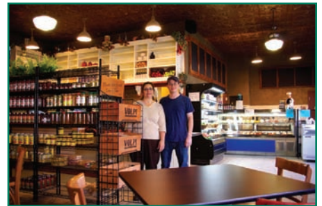
Sweet Water Deli, 316 Canal St.