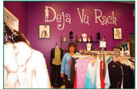
Deja Vu Rack, 1243 State Street