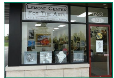
Lemont Center for the Arts 1243 State Street, Unit 101

December 17 ~ 5:00 p.m. - 9:00 p.m. December 18 ~ 10:00 a.m. - 4:00 p.m. December 19 ~ Noon - 4:00 p.m.