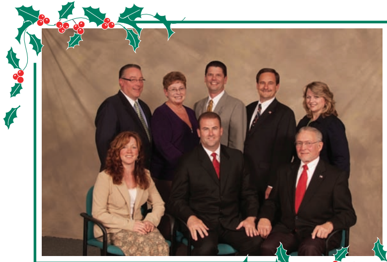
From our families to yours, a Joyous Holiday Season!