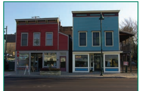
Rummage Inn, 238 Main Street; Lola's Consignment, 236 Main St.

Support The 3/50 Project Save Your Local Economy 3 Stores at a Time!