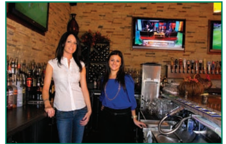
Front Street Cantina, 319 Front St.