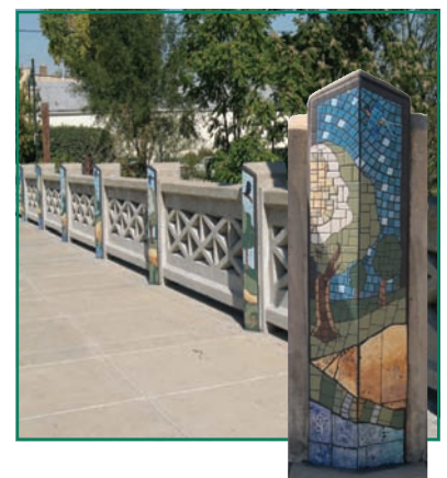
The Art & Culture Commission's most recent Public Art Project on the Stephen Street Bridge.

Hard copies of the survey are available at the Village Hall, Lemont Public Library, Lemont Park District and at several other locations around town. Completed surveys can be mailed to the Village of Lemont, 418 Main Street, Lemont, IL 60439 or placed in Art & Culture Commission Survey Boxes at the Lemont Public Library, the Village Hall, or the Lemont Park District.