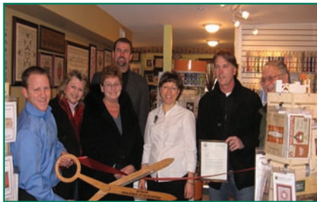
Inspired Needle, 315 Illinois Street