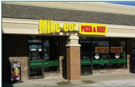
Mike-Eez Pizza, 1066 S. State Street