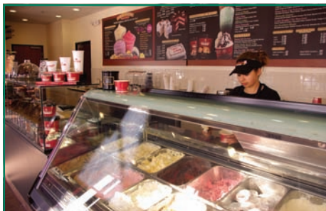
Coldstone Creamery, 1251 State Street