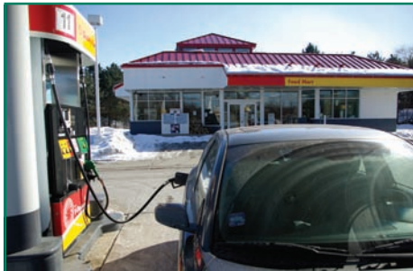
Shell Gas Station, Archer & McCarthy