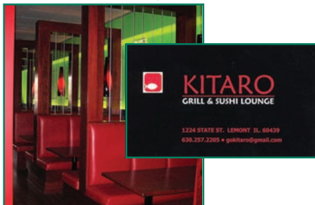
Kitaro Grill & Sushi Lounge, 1224 State Street