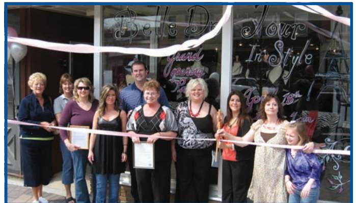
Belle De Jour - In Style, 114 Stephen Street Grand Opening Celebration