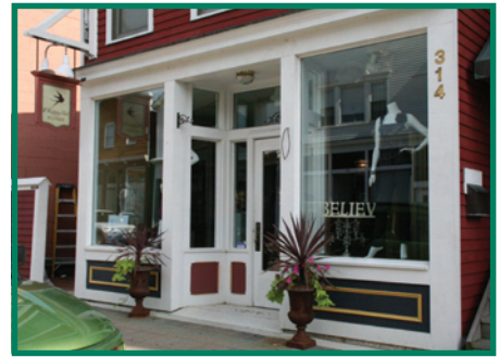
1 Happy Girl 314 Canal Street