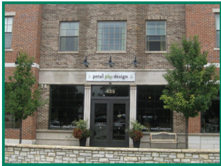
Petal Play Design Studio Moves to 435 Talcott