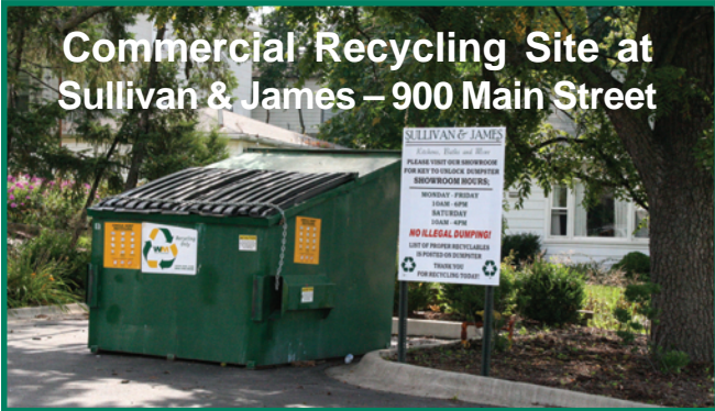
Commercial Recycling Site at Sullivan & James – 900 Main Street

Most businesses in Lemont do not have the option of recycling because they have commercial hauling accounts that do not offer a recycling program.