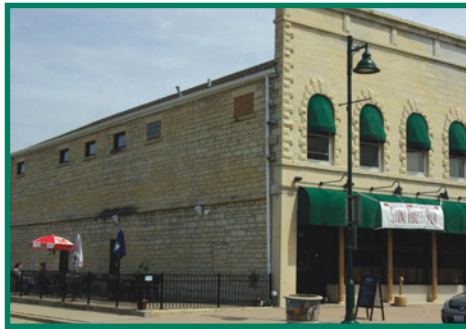
Stone House Pub 103 Stephen Street