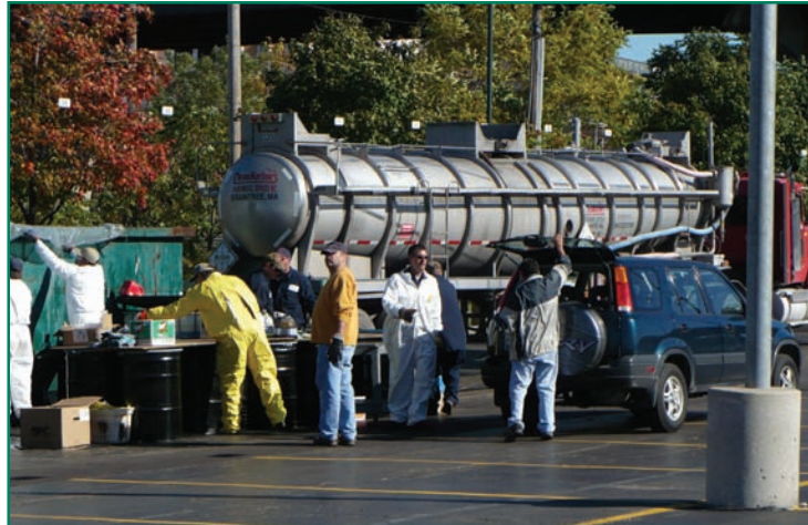
Motor Oil Recycling Day

Lemont Environmental Advisory Commission sponsors and staffs two motor oil recycling events each year. In 2007, about 4,000 gallons of used oil, 125 gallons of anti-freeze and 200 gallons of flammable liquids were collected. Citgo Refinery and IMTT-Lemont co-sponsor the events.