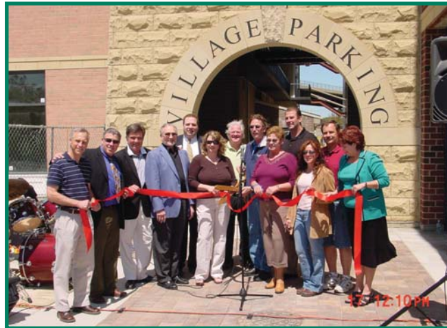
Ribbon Cutting on May 17th at the River Street Parking Garage. About 150 spaces will be available starting in mid-June for public parking.