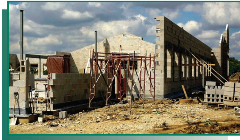
Construction of the Police Facility is underway at the 127th Street site.