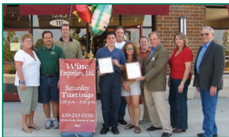
Wine Emporium, 1243 State Street