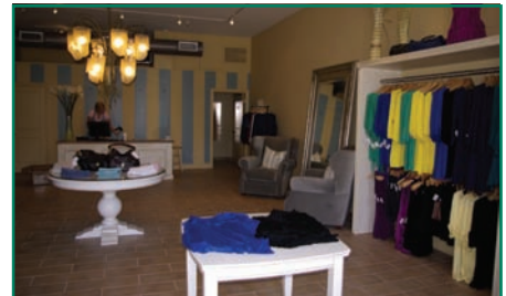
Jakk's Apparel, 445 Talcott Street