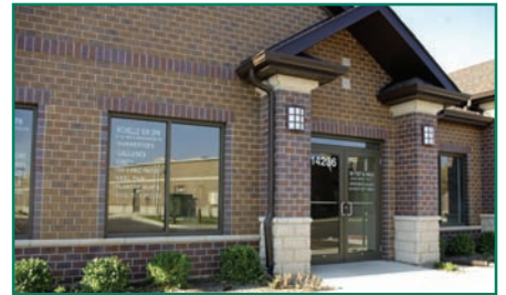
DM Foot & Ankle Clinic, Derby Plaza