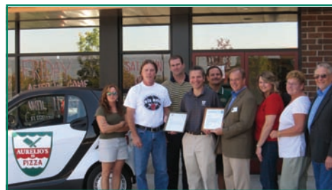
Aurelio's Pizza, 1243 State Street