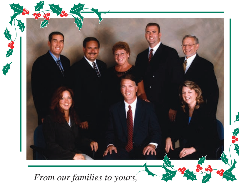
From our families to yours, a Joyous Holiday Season!