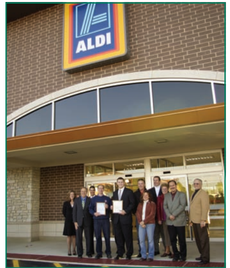
Aldi's Grand Opening, 1237 State St.