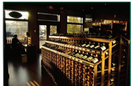
Bottles, 439 Talcott Street