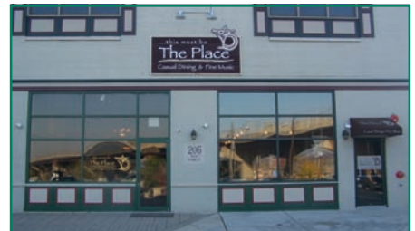
This Must Be The Place, 206 Main St.