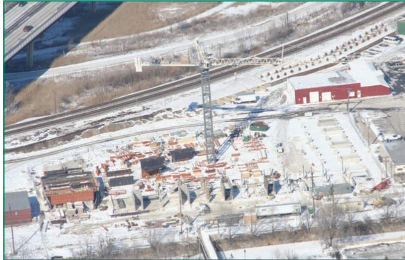
Aerial View Downtown Redevelopment Phase I at 340 River Street is now under construction. This phase includes 82 for sale residential units and 24,346 sq. ft. of retail space along with a 262 car parking deck.