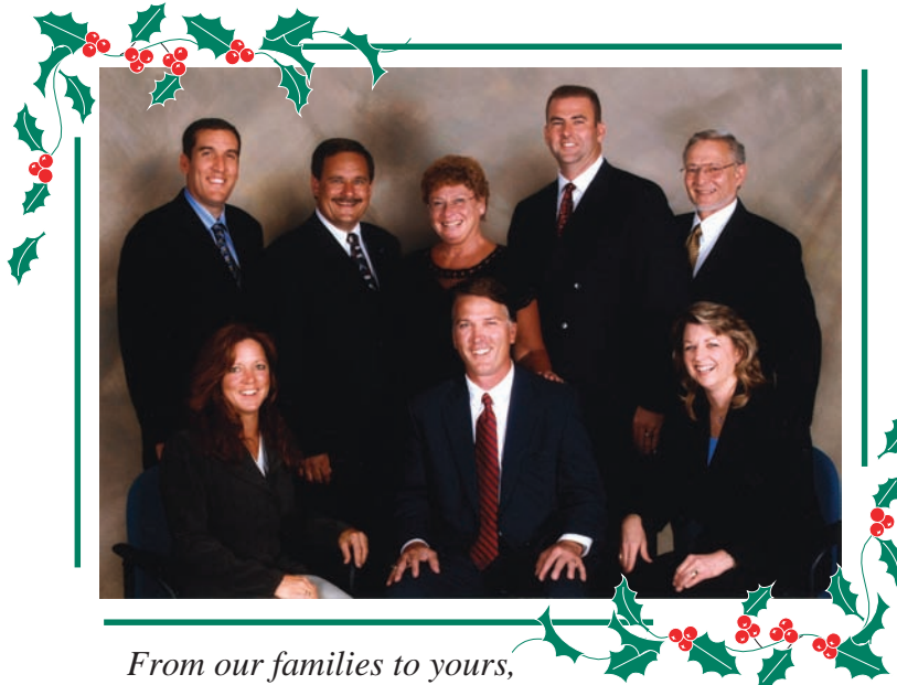
From our families to yours, a very Happy Holiday Season!