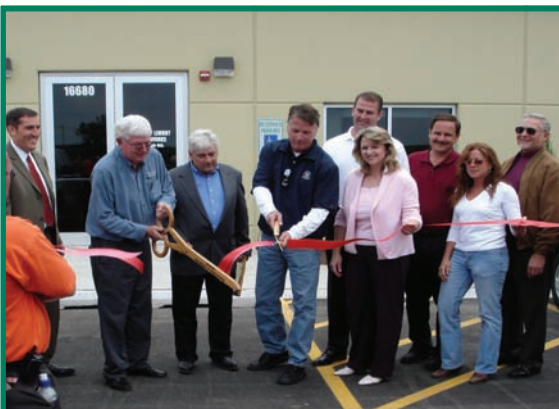
Ribbon cutting at new Public Works facility on May 19.