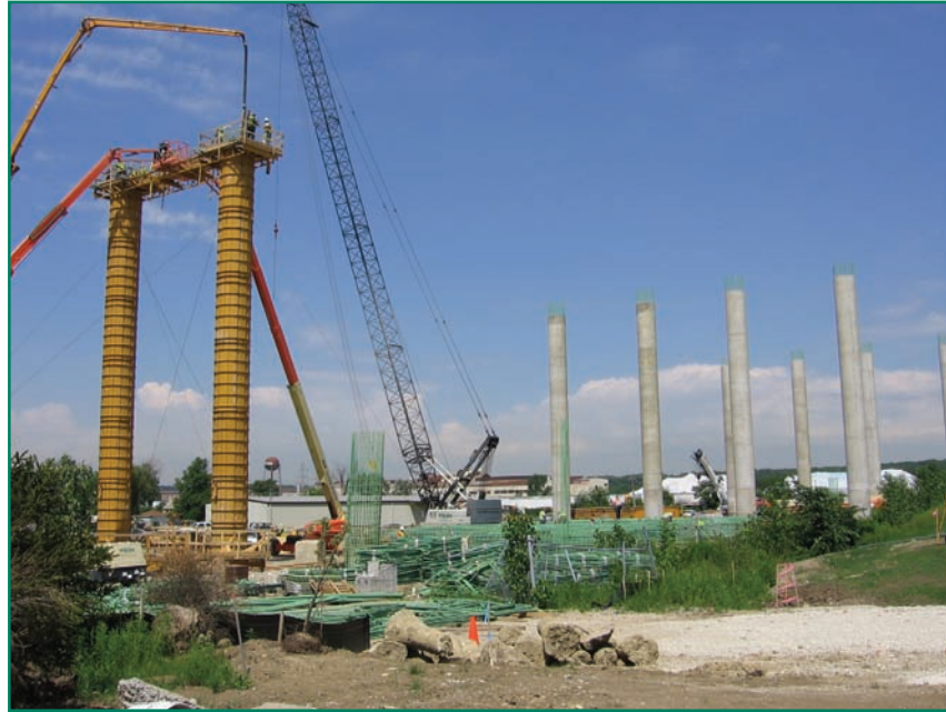
Supports for the 1.5 mile I-355 Tollway bridge are under construction and can be viewed along New Avenue near the new Public Works Building.

Farmer's Market Begins Tuesday, June 27 8:00 a.m. - 1:00 p.m. Budnik Plaza