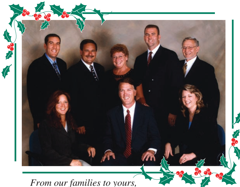
From our families to yours, a very Happy Holiday Season!