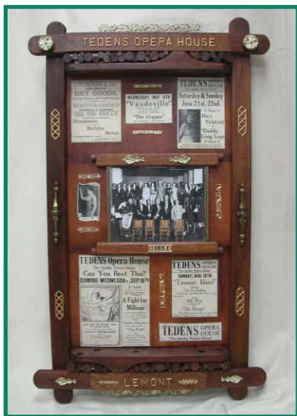
One of 14 chairs being raffled off by the Art & Culture Commission.