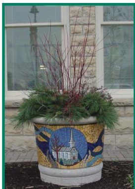
The Commission's goal is to produce 12 additional planters.

The winning tickets will be drawn at the Mayor's Drive for Charity on April 25.