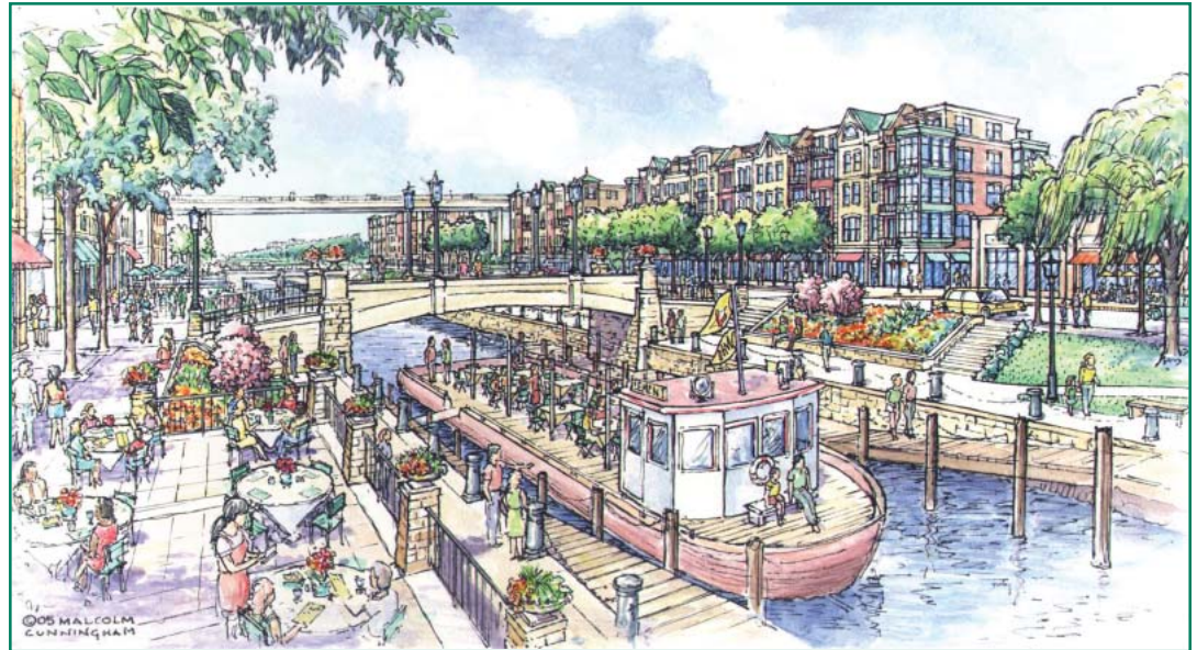
This architectural rendering by Dover, Kohl & Associates depicts Phase I of the Downtown Redevelopment, and the concept proposed by the developer for the I & M Canal between Stephen Street & Bossert Drive. An artificial lock and stationary Canal Boat could be used for community events or private functions.