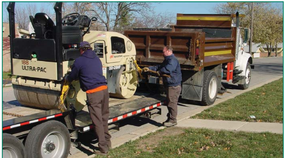
Twelve additional alleys were paved by Public Works during this construction season.

To report street light outages or for additional information on these projects, please contact the Public Works Department at 630-257-2532 or via e-mail at publicworks@lemont.il.us .