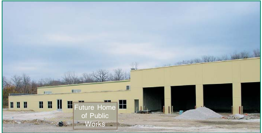
The New Public Works facility at 16680 New Avenue will be ready for occupancy by the end of the year.