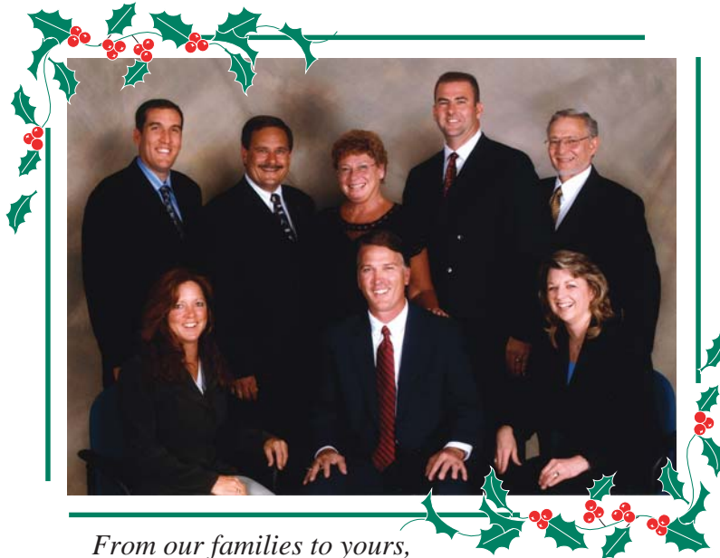
From our families to yours, a very Happy Holiday Season!