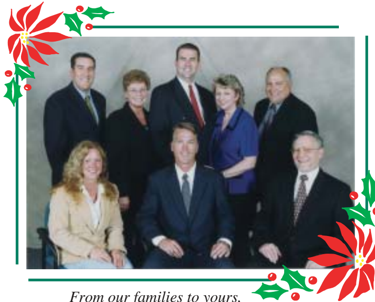
From our families to yours, a very Happy Holiday Season!