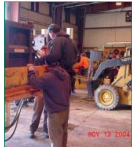
Public Works personnel readies salting and snow removal equipment for the winter season.

Mailboxes in the Village right-of-way are sometimes damaged during snow removal. These will be replaced with a standard rural route mailbox. Any grassy areas damaged by plows will be identified and repaired next spring.