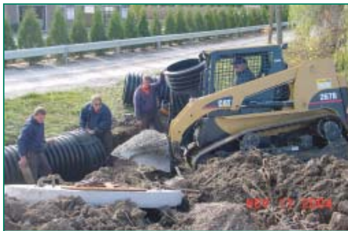
New storm sewers and sidewalks on south State Street will greatly improve public safety.

The Village Board recently approved the design of the well house, intended to complement the surrounding residential development. The addition of this well will help to meet Village water needs for several years.