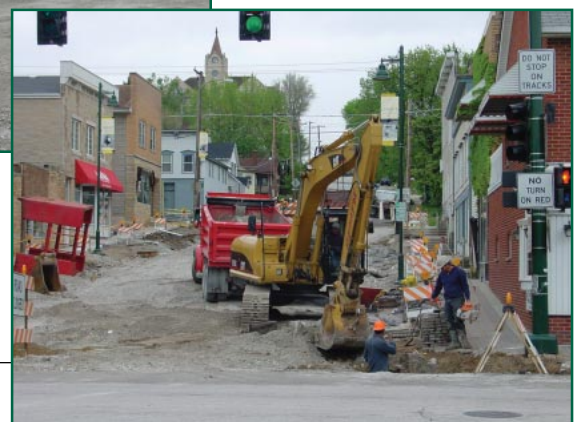
Stephen Street reconstruction project is in full swing with $2.5 million in improvements.