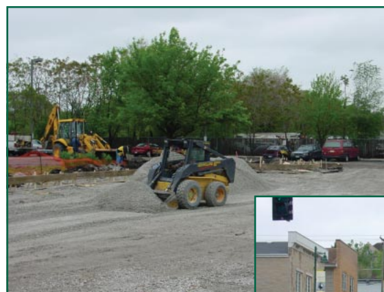
The new Talcott Street public parking lot is located on the north side of Talcott Street, behind La Dolce Vita.