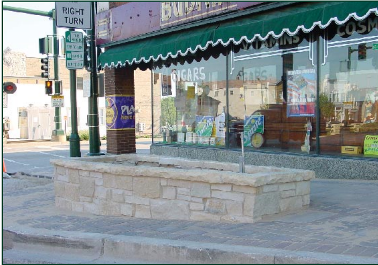
The streetscape on Stephen Street begins to take shape with the installation of planter boxes and sidewalk pavers between Main & Illinois Streets.

The Stephen Street reconstruction continues to move along just about on schedule. By September 15, the most complicated portions of the project leg between the I & M Canal and the tracks should be wrapping up. At that time, the street will receive a preliminary surface and will once again be open to traffic.