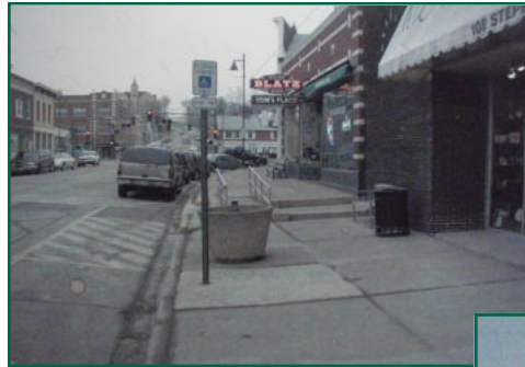
Stephen Street "Before"