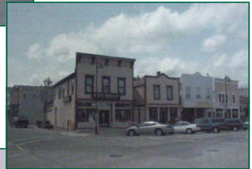
Stephen Street "After"

New sidewalks, street lighting pavement and most importantly, new infrastructure improvements downtown.