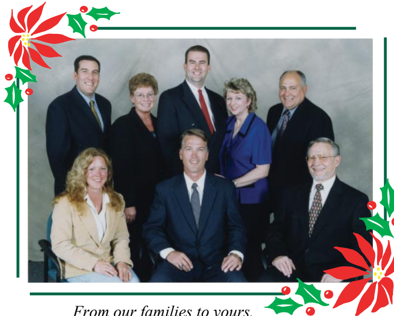
From our families to yours, a very Happy Holiday Season!