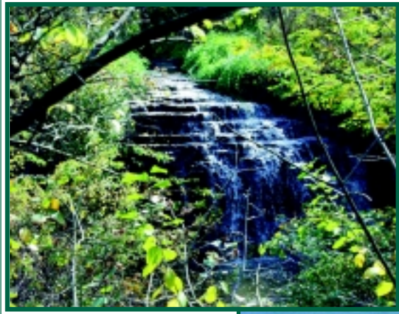
Heritage Quarries - Revised Conceptual Master Plan, includes 86 acres of recreational potential, with trails, woodlands, wetlands, and crystal clear quarry lakes, located just east of historic downtown Lemont.